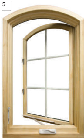
5 | PRODUCT Mira Premium Picture Casement Window MANUFACTURER Ply Gem Windows plygemwindows.com

Designed for residential and commercial spaces, Majesta double-hung, oversized windows marry traditional styling with energy efficiency. The made-to-order collection comes in sizes up to 6' x 12'; frame options include FSC-certified wood varieties as well as anodized- or painted-aluminum cladding. Choose between brass, rustic umber, or brushed nickel hardware. Energy-efficient glass and triple glazing can be specified, as can sashes with heavy-duty weather stripping. Coordinating single-hung, radius, and cottage-style windows are also available. CIRCLE 203