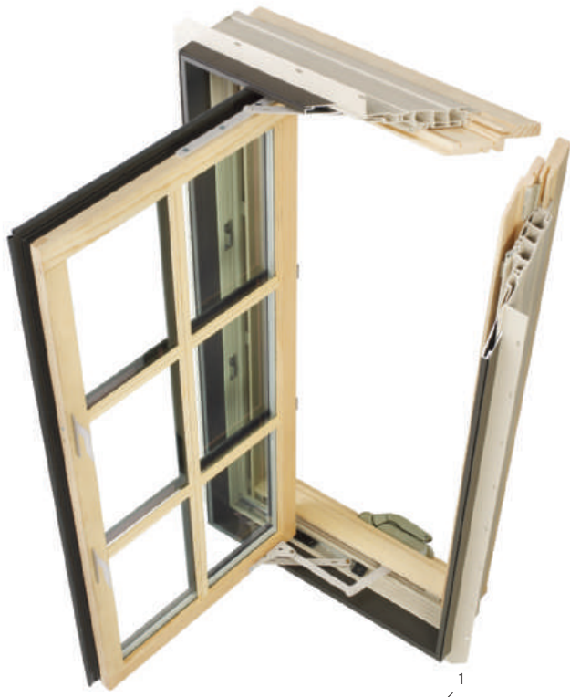
1 | PRODUCT Majesta Double-Hung Window MANUFACTURER Kolbe Windows & Doors kolbe-kolbe.com

Designed for residential and commercial spaces, Majesta double-hung, oversized windows marry traditional styling with energy efficiency. The made-to-order collection comes in sizes up to 6' x 12'; frame options include FSC-certified wood varieties as well as anodized- or painted-aluminum cladding. Choose between brass, rustic umber, or brushed nickel hardware. Energy-efficient glass and triple glazing can be specified, as can sashes with heavy-duty weather stripping. Coordinating single-hung, radius, and cottage-style windows are also available. CIRCLE 203